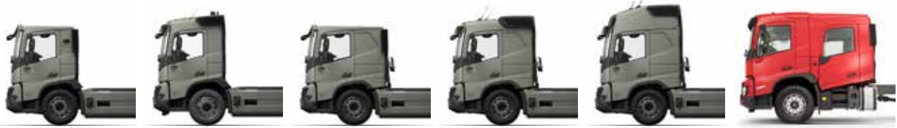
Low day cab