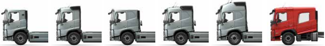
Low day cab