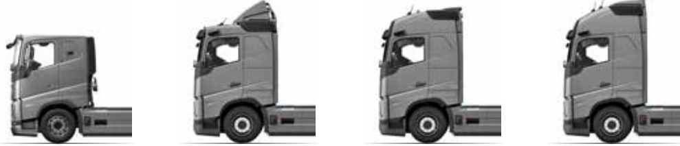
Low sleeper cab