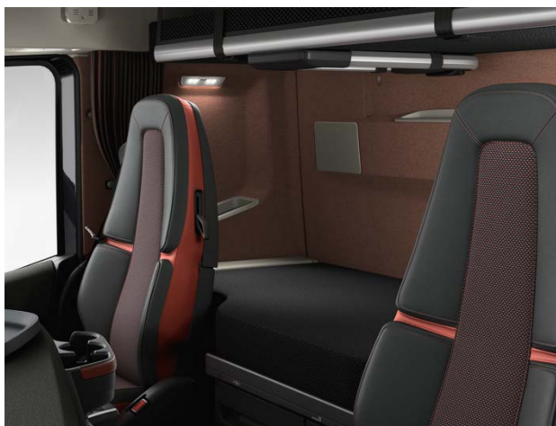
THE VOLVO FH16 TRIM. Textile and leather upholstery. Coral rubber mats, Coral decor trim and Bright Chrome trim lists.

The Volvo FH16 comes with a unique interior – available for the Volvo FH16 only. Choose between the textile or leather trim level. On top of this, you can choose from a wide range of colours. You'll find your style. To fully explore the different interior trim levels, use the Volvo Truck Builder on www.volvotrucks.co.za