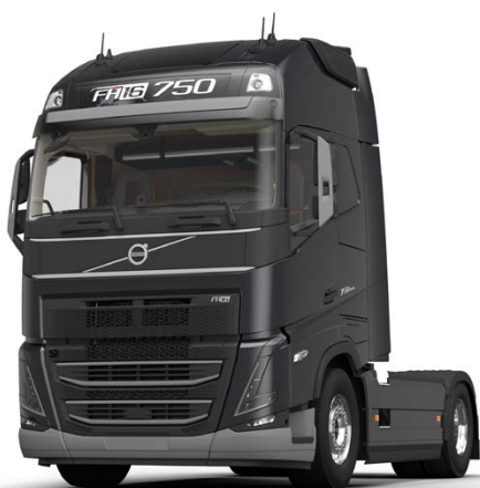
BASIC TRIM. Black grille and thunder grey bumper, mirrors and other details. Only the cab body is painted.

Choose between three different exterior trims and hundreds of colours to suit your taste and your practical needs. To fully explore the different exterior trim levels, use the Volvo Truck Builder on www.volvotrucks.co.za