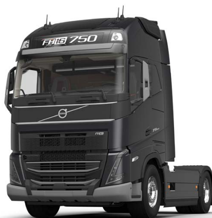
BASIC WITH STURDY FRONT TRIM. Heavy-duty bumper. Black grille and thunder grey bumper, mirrors and other details. Only the cab body is painted. Headlamps with black theme.