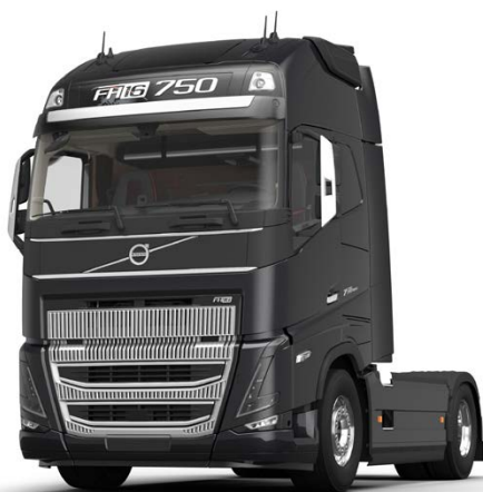
THE VOLVO FH16 TRIM. Unique silver-finished Volvo FH16 grille and headlamps with a black theme. Bumpers, mirrors etc, are all painted in the body colour. Aluminum details on interstep.