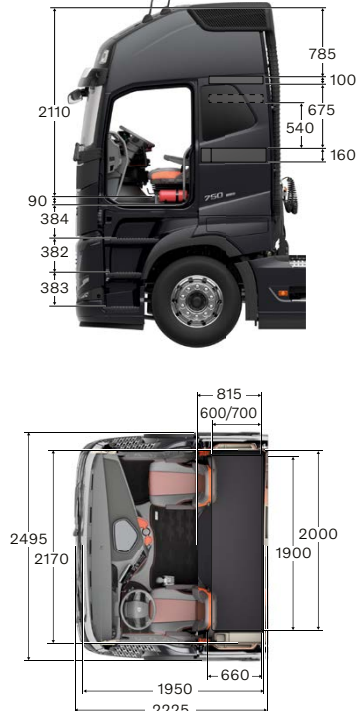
GLOBETROTTER XL CAB